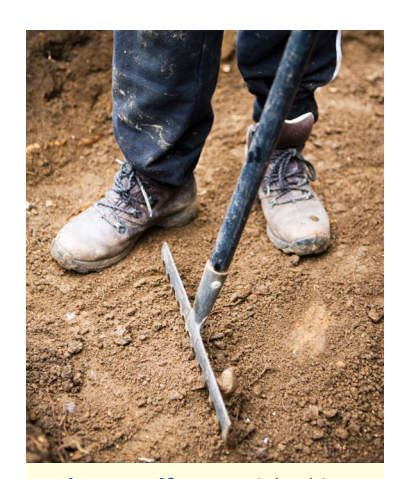
Ask yourself: How might this image help us explore 'Jesus is

Create a Christingle using a large orange to represent the world, a red ribbon tied around it to show Jesus' love poured out, sweets on four cocktail sticks as the four corners of the world, and a candle in the centre of the orange, to symbolise Jesus as the light of the world. Put equal amounts of sweets on the sticks, to show how Jesus came to bring equality for all. Light the candle, and pray for any areas of the world which are in need of Jesus' love and light this Christmas.