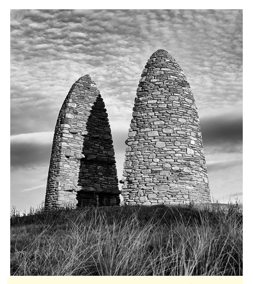
Find out about this memorial cairn (do an internet search for 'Aignish cairn'). Why is it important to remember past events?

We may find ourselves in difficult times in life. We know that life may not always be easy, but we also know that God will be with us at all times. Often, the difficulties we face have been faced by others before us, and we can benefit from their experience and support.